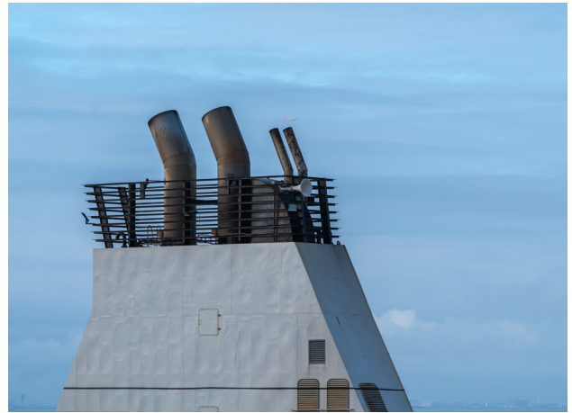
2% energy loss for one of the most energy efficient solutions on the market, to reduce your carbon footprint