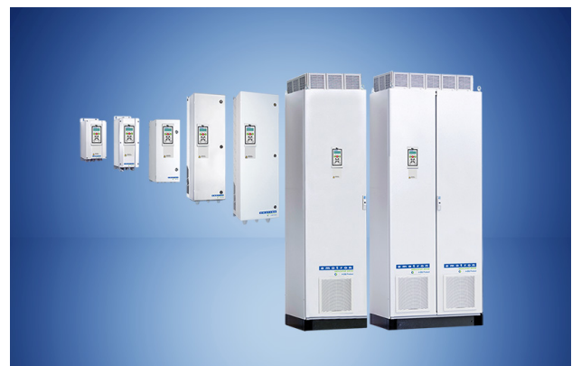
Emotron IP54 FDU drives up to 4MW

Specific marine requirements such as unique colouring, cable adaptations and particular labelling requirements are easily met with the help of our skilled marine project teams.