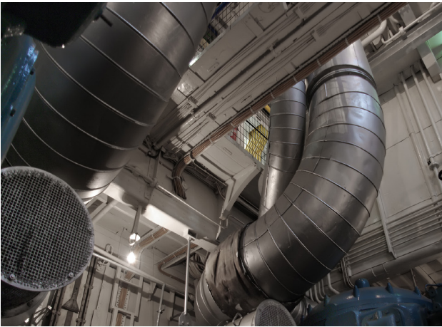
Emotron marine project teams are experienced working with retrofit challenges